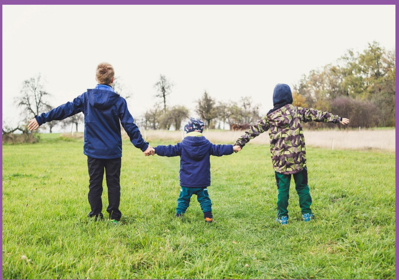
For learners with Education Health and Care Plans additional transition information relating to the